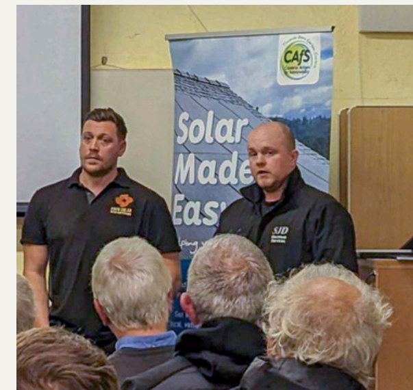
(Above) Contractors speaking at one of our Solar Made Easy community events

Our work to support other community energy projects continues. We have helped several communities with feasibility work, including an energy efficiency and renewable energy assessment of a community building, a study into three residential sites where they wished to explore sharing solar PV across individual units, the feasibility of a community-owned solar scheme involving a large industrial building, two schools and a rugby club, and work to support the development of a shared community heat project, that would serve four community facilities.