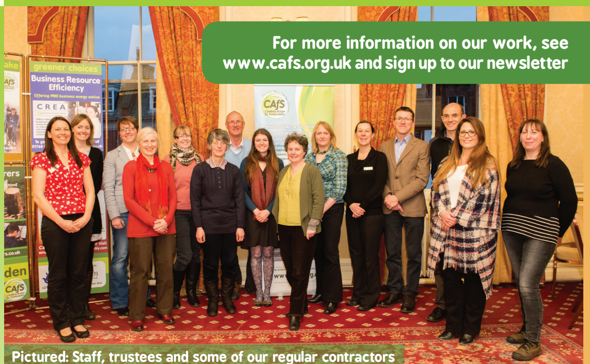
Pictured: Staff, trustees and some of our regular contractors

Our full business plan priorities can be found at www.cafs.org.uk/about-us/annual-report