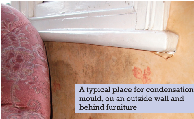
A typical place for condensation mould, on an outside wall and behind furniture

rooms so the radiator gives out a little bit of heat whenever you have the heating on. If you don't have central heating, consider using a room heater with a timer and temperature control. Remember, unused rooms will need a good airing from time to time.